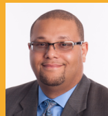
OKPARA RICE USA