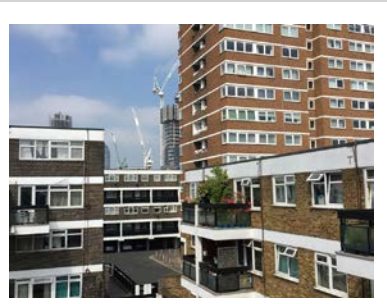
AirBnB Flat 16 of London Borough of Hackney Council Flats sold in Thatcher era

the flat actually opened the door leading from the street to four different flats, but none numbered 16. Finally, I found my way to the correct flat and my allocated room.