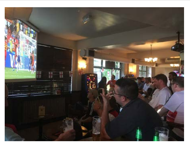
World Cup Matches were being aired in every London Pub

In the end, I found myself living in a block of 1970s era Council Flats, and Number 16 had