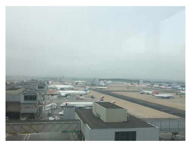
Emirates Airlines via Auckland to Dubai into London Gatwick International Airport

into London's Victoria Station is the easiest option available as the Blue Piccadilly Line intersects with the Black Northern Line at King's Cross. I was reminded again the importance of travelling light! Northern Line south to Old Street.