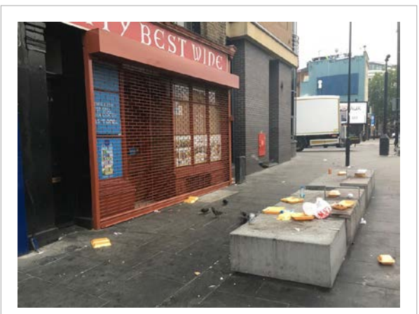
The Morning After – England crashed out of the World Cup

Needless to say, I didn't spend much time in my AirBnB room! I spent a lot of time walking around the Hackney neighborhood and sought lunch options at local cafes where locals took an interest in a visitor coming to their café from New Zealand, World Cup Football offered opportunities to follow daily matches in local pubs. The weather was unseasonably warm. I smiled at a young entrepreneur with a dogwalking business who was tending for 6 dogs living in local flats; a Husky, a Greyhound, a Whippet, a Collie, a Spaniel and a Boxer!