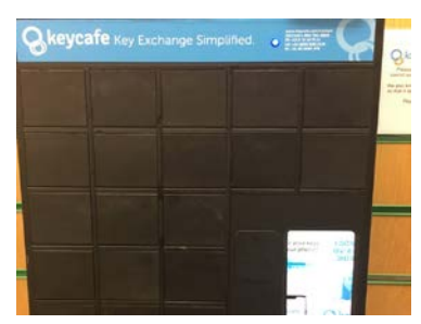
Obtain key to Flat 16 from a Key Safe located in a 24-hour Corner Store