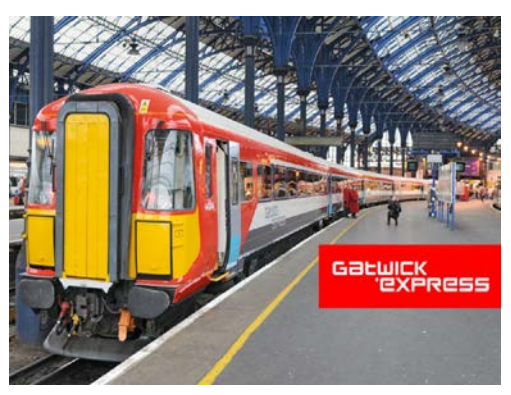
The Gatwick Express train into Victoria Station on the Piccadilly Line

the corner of two streets in Hackney. Google Maps and I explore multiple back streets and areas of urban development before we found the shop and located the Key Safe as instructed. I was fortunate to have help from the Corner Shop Manager who helped me to find my AirBnB Flat! The address I had was not correct. The key to