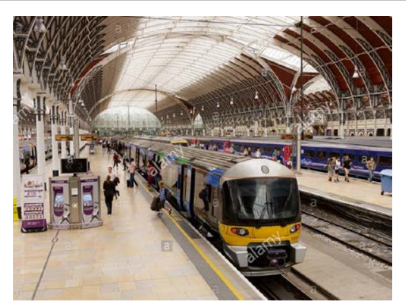
The Heathrow Express from Paddington Station on the Bakerloo Line