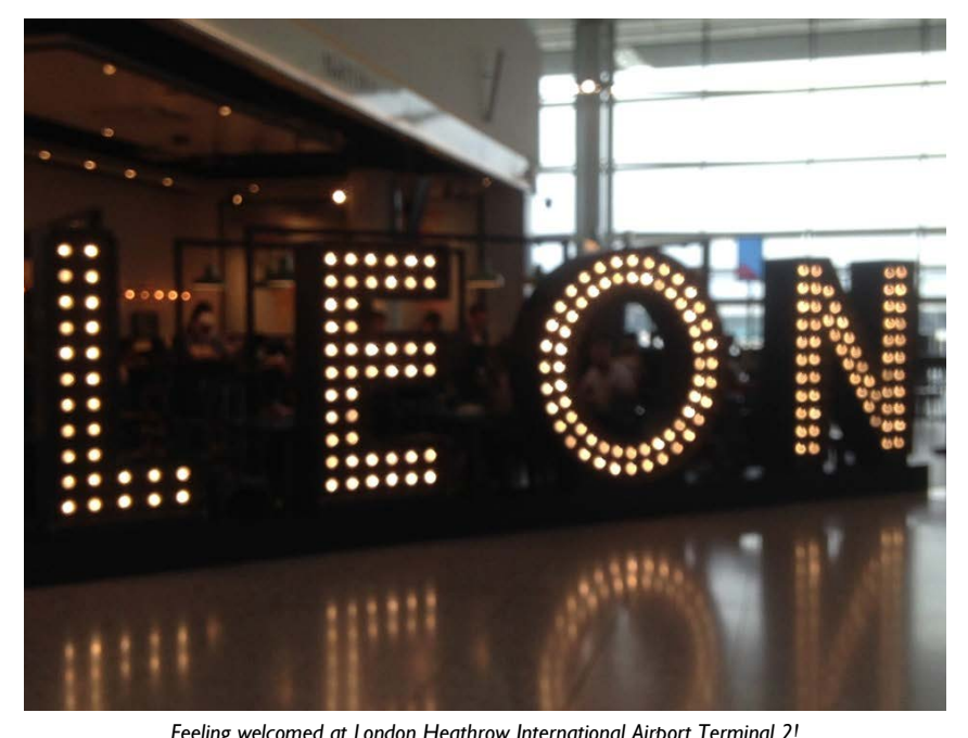
Feeling welcomed at London Heathrow International Airport Terminal 2!

Because of time zone differences between New Zealand and London, I found myself waking up early whilst there and going for a walk. World Cup revelers were still staggering in the streets, and the streets were strewn with partially eaten kebab takeaways.