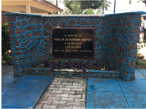
The Professor Dr. Dr. Hermann Gmeiner Memorial on the Beach Front – May His Soul Rest in Peace

This beachfront memorial recognises the inspirational achievements of an important figure