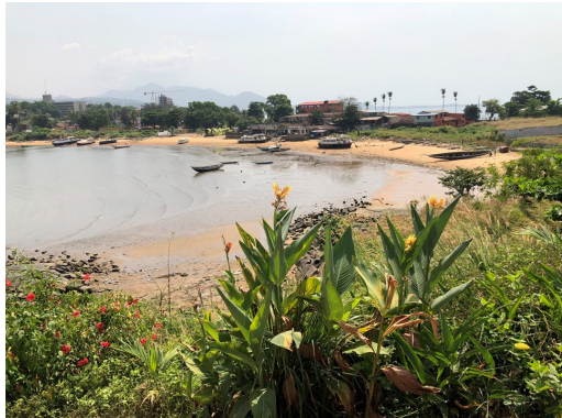
Erecting a Freetown Christmas tree presents many construction challenges!