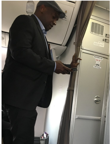
Travelling with the President from Nairobi to Accra, then Monrovia, and then Freetown, Sierra Leone

I travelled to Freetown with Kenya Airways and found myself upgraded to Business Class. At Nairobi I was wondering why so few people used the Business Class option. Then, the President of Sierra Leone and his