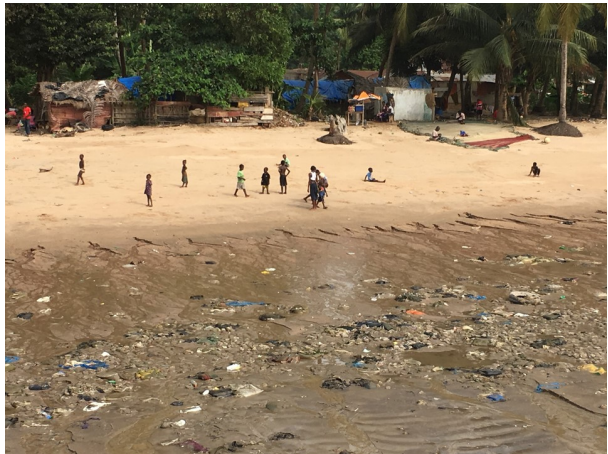
Children playing on the pollution-strewn beach at Lungi International Airport Ferry Terminal