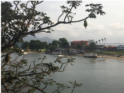
Fishing boats along a Freetown foreshore at the back of the Learning Workshop Hotel Venue

Like children everywhere, a group of Sierra Leone children were playing a modified form of football on the Lungi beachfront. The rubbish scattered all along the beachfront was a scary introduction to what followed in Freetown.