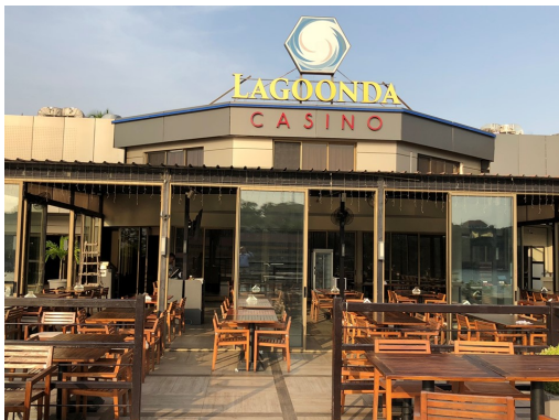
The Lebanese Lagoonda Hotel, Conference and Casino Venue in a Freetown Suburb