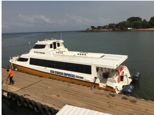
A 30-minute Ferry from Lungi International Airport to Freetown across the best harbour in W. Africa

On arrival at Freetown International Airport, one learns about the thirty-minute ferry ride across Freetown Harbour – the only